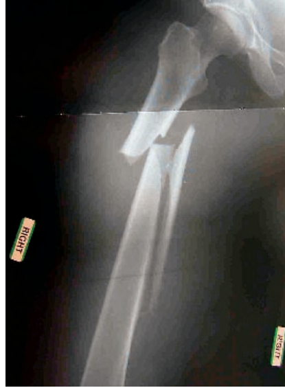
X-ray of comminuted spiral fracture involving upper half of right femur.

the incidence of bilateral stress reactions and fractures in more than half of their patients, the authors conclude that these patients have a systemic disorder reflecting oversuppression of bone turnover rather than localized pathology. They advise cautious administration of alendronate in osteoporosis management, and “in situations where the characteristic subtrochanteric fractures have already developed, physicians should strongly consider discontinuing the drug.”