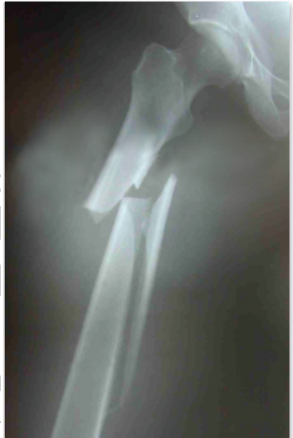
The case patient's hip x-ray showing a comminuted spiral fracture involving the upper half of the right femur.

read as "There is slight thickening of the cortex of the right femur laterally, significance uncertain. Suspect this is simply normal variation." Because the pain persisted, a bone scan was done, and it was read as "Intense focus of radionuclide uptake in the proximal right femur correlating with a focal area of cortical thickening. This finding is very suggestive of a possible underlying osteoid osteoma. Radiographs reveal no